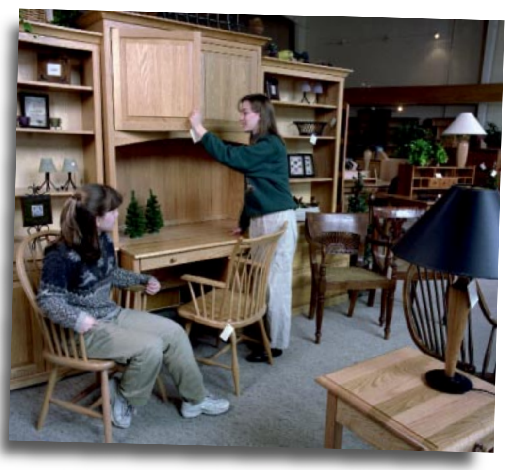
From furniture to flooring, there are thousands of hardwood lumber products.

Pennsylvania also exports some logs and lumber to other states or countries for further manufacturing. Pennsylvania's hardwood lumber is among the finest in the world. It has beauti-